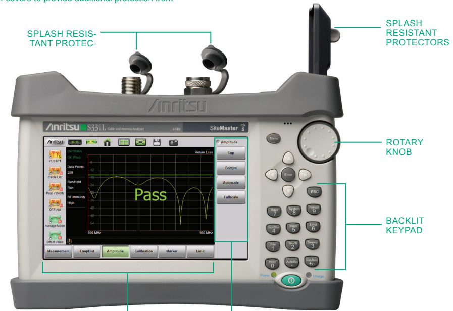
MAIN MENU KEYS SUBMENU KEYS