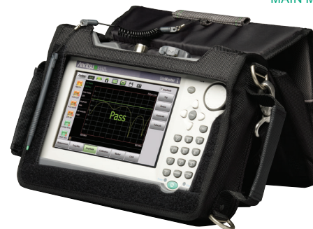
SIZE: 250 mm x 177 mm x 61 mm (10 in. x 7.1 in. x 2.4 in.) WEIGHT: < 2.0 kg (4.4 lbs), INCLUDING BATTERY